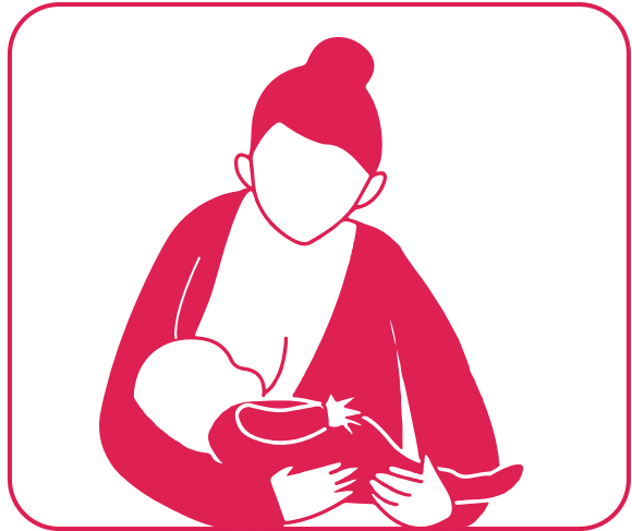
Cradle Hold (Same Arm)

After that, breastfeeding exclusively for 6 months is easy; and so is continuing breastfeeding up to 2 years or more.