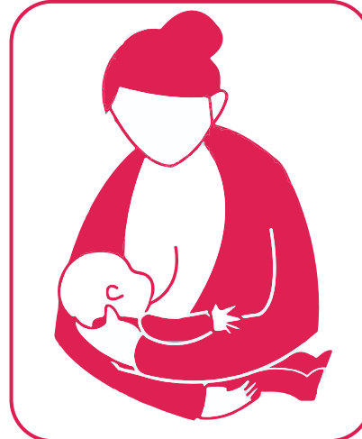
Cradle Hold (Opposite Arm)