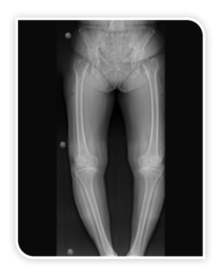
LONG FILM X-RAY

Digital Portable X-ray Machine allows high-quality images to be acquired and sent directly to a Picture Archiving Computer System (PACS) where they are viewed by the Radiologists.