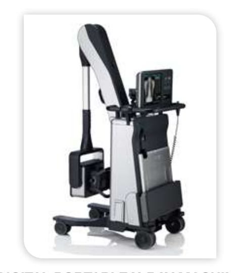
DIGITAL PORTABLE X-RAY MACHINE